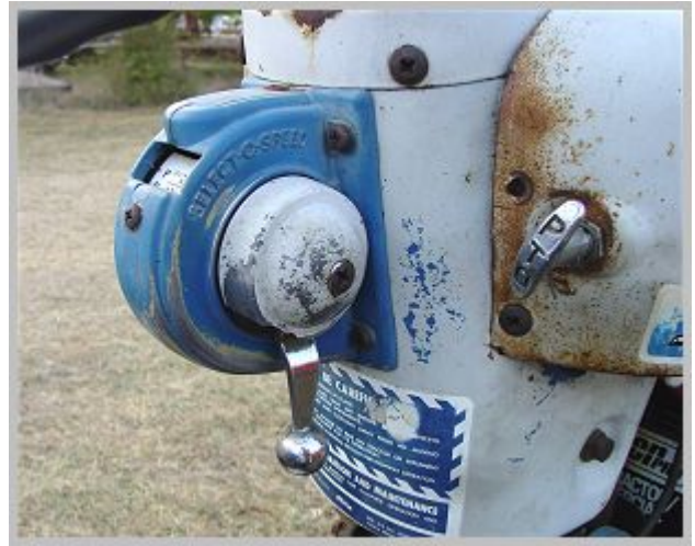
The Select-O-Speed transmission shifter Introduced in 1959 used thru 1964

Model and serial numbers for the "01" series tractors are located in the same place as the hundred series tractors.