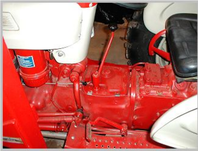
The 5 speed transmission shifter Used 1955 - 1964