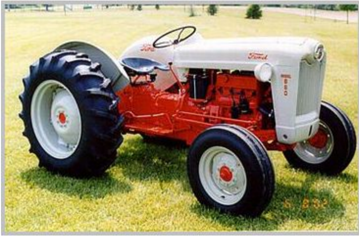
Hundred series utility tractor