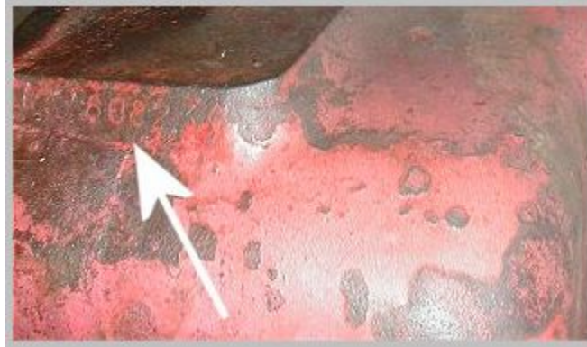
Later NAA serial number location

Serial number location on later NAA models was on the left side of the transmission case just below the flat above the starter bulge as shown in the photo below.