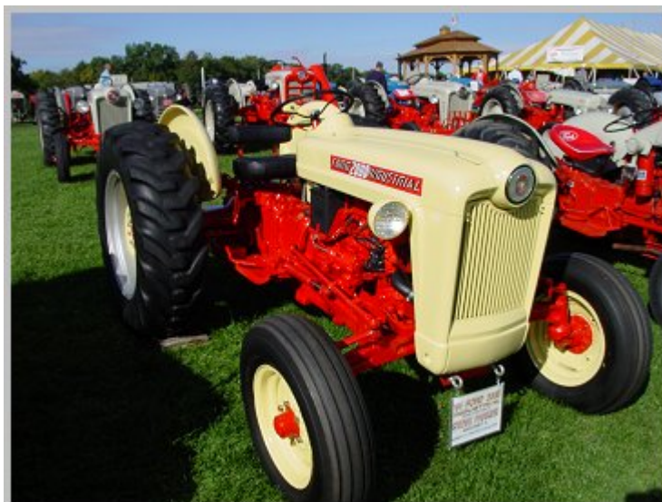
A 1961 2000 Industrial tractor

Near the end of 1960 Ford introduced the first of the Thousand series tractors as Industrial models. These tractors were painted red and "buff" and were basically modified "01" series models with a different seat, industrial tread rear tires, and a heavier fixed width front axle. The light industrial models were the 2030 and 4030 with the 4040 being the heavy industrial. It was basically the same as the earlier 1801 industrial tractors.