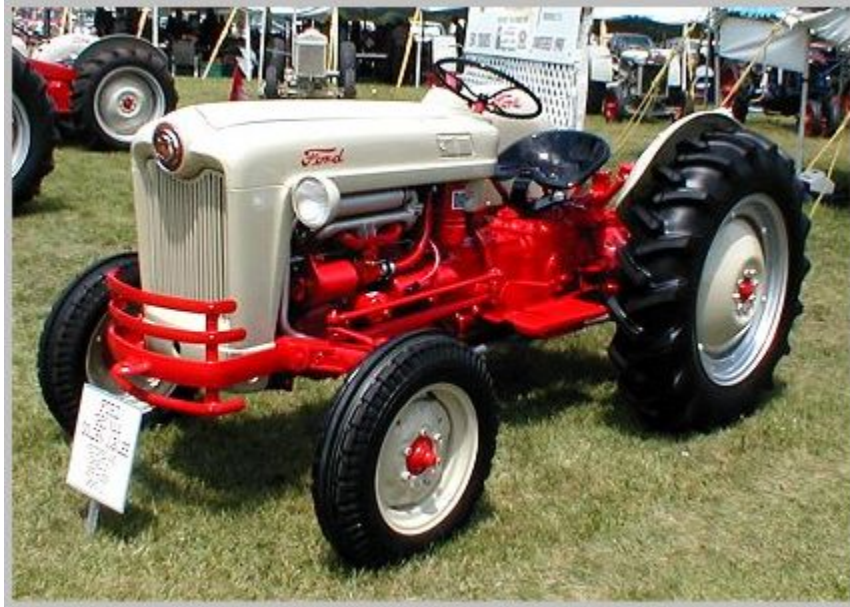
The 1953 NAA Jubilee

In late '52 Ford introduced the new NAA series tractor for '53 which marked the end of 8N production. 1953 was Ford's 50th anniversary so the new tractor was called the Golden Jubilee in celebration of that event. The NAA - Jubilee had a more powerful overhead valve engine, live hydraulics, and redesigned front sheet metal with the "cyclops" medallion in the center of the hood. It was slightly taller, longer, and heavier than the 8N.