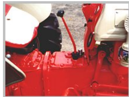
8N 4 speed transmission