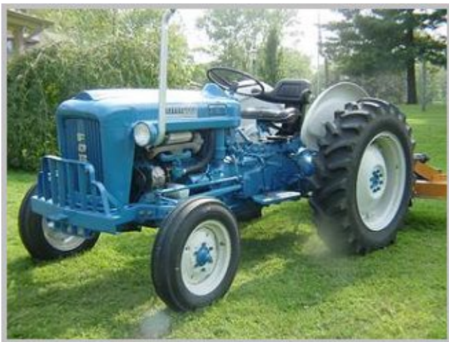
1963-64 2000 series

In 1962 Ford introduced the first Thousand series utility tractors, the 2000, 4000, and 6000. The 2000 and 4000 series tractors were basically the same as the 601 and 801 series tractors but with a slightly restyled grille that ended 10 years of the "cyclops" front emblem. The 6000 series was an all new and much larger 6 cylinder Select-O-Speed tractor. The thousand series tractors were painted the new Ford corporate blue color with a lighter gray trim and the familiar red and gray was gone except for a few red and "buff" industrial models.