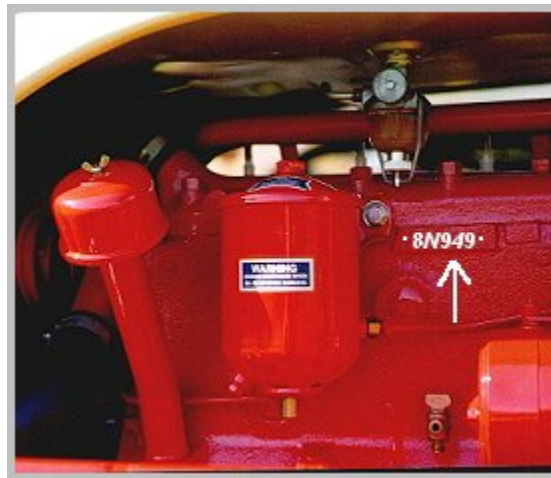
9N-2N-8N Serial number location

Serial numbers for 9N-2N-8N tractors are located on the left side of the engine block, just below the head and behind the oil filter.