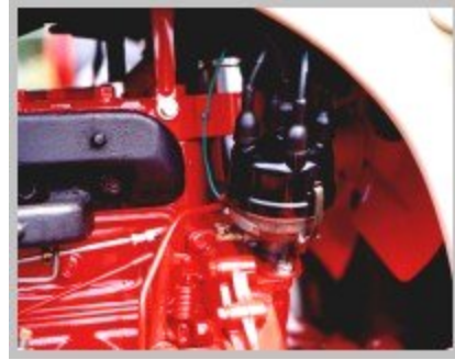
'50-'52 side mount distributor