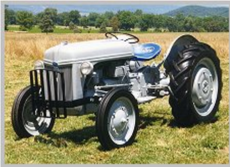
9N or 2N Ford Tractor

Just a quick glance from a distance can tell you whether you're looking at a 9N-2N or an 8N Ford tractor. Note the difference in the wheel lug bolt patterns in the photos below.