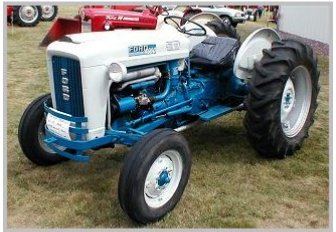
1963-64 4000 series