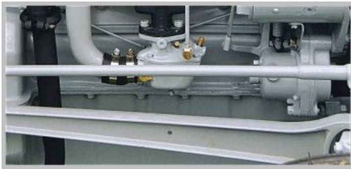
9N-2N pre '44 "I" beam style radius rod