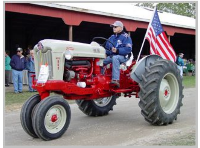
Hundred series row crop tractor