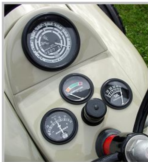
The NAA and Hundred series tractor dash panel