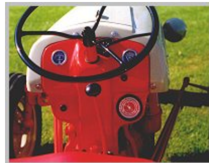
'50-'52 8N dash with Proofmeter