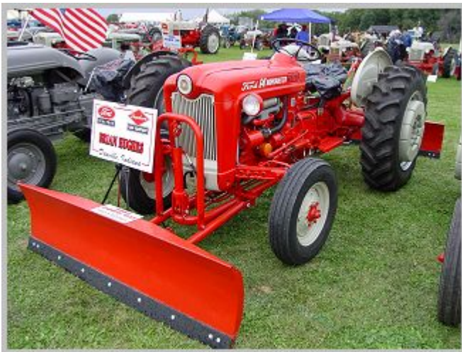
The 601 Workmaster series tractor

The "01" series hood emblem was the first one to be made of plastic