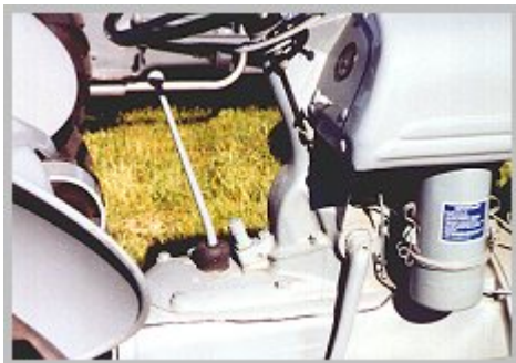
9N-2N 3 speed transmission