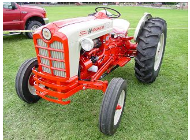
The 801 Powermaster series tractor