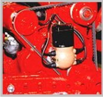
'39-'50 front mount distributor