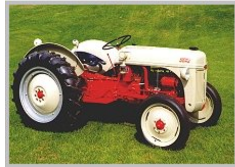
8N Ford Tractor

Serial numbers for 9N-2N-8N tractors are located on the left side of the engine block, just below the head and behind the oil filter.