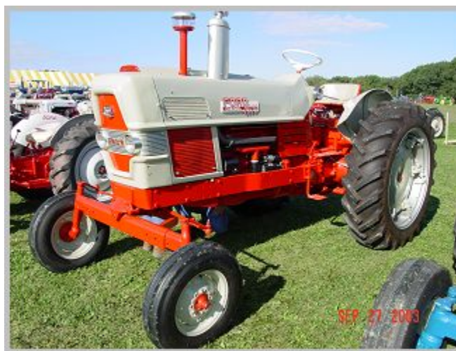
A red painted model 6000 built in '62 The '63 and newer models were blue