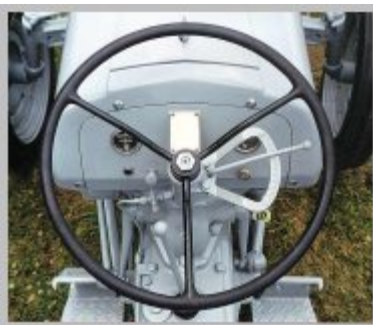
1940-'47 9N-2N dash