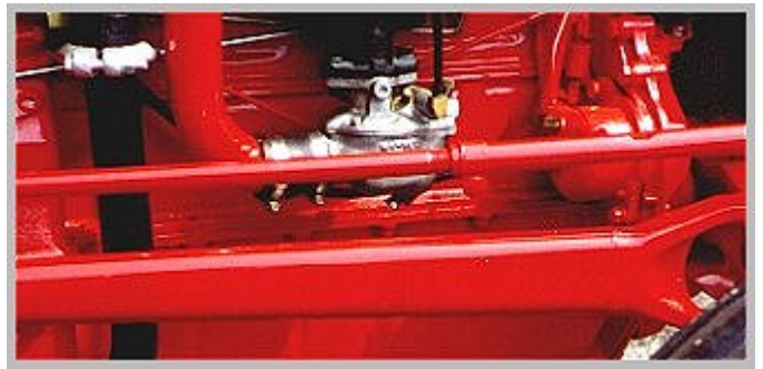
'44 2N-'52 8N oval tube radius rod