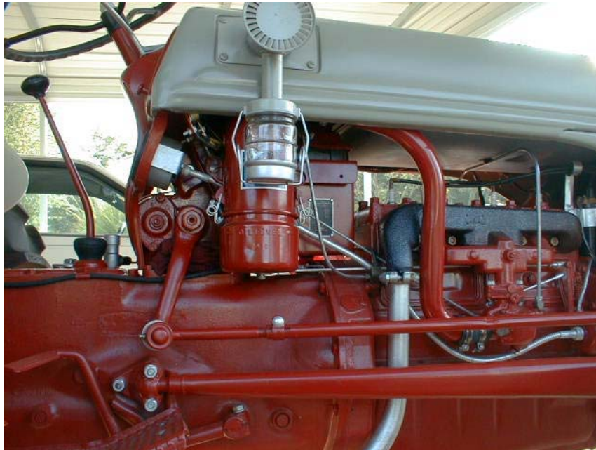
Decal is behind the glass jar on the canister.

FOR LONG ENGINE LIFE SERVICE OIL CUP DAILY. VERY DUSTY CONDITIONS TWICE DAILY. SERVICE BODY MONTHLY-REMOVE AND THOROUGHLY CLEAN WITH SOLVENT. VERY DUSTY CONDITIONS CLEAN MORE OFTEN. USE SAME GRADE OIL RECOMMENDED IN CRANKCASE KEEP INLET SCREEN & TUBE CLEAN AND FREE OF OIL. KEEP HOSE CONNECTIONS TIGHT. REFER TO OWNERS MANUAL.